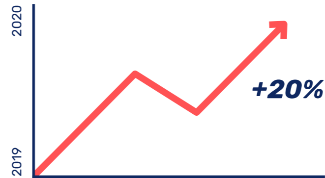
increase of young people sleeping rough in 2020 compared to 2019

The pandemic also affected the support that was available to young people. The closure of youth clubs and youth centres took away a lifeline for many young people who rely on these for emotional wellbeing and connections to other providers. The shift to remote working meant that waiting times for many other services increased and accessing assistance from councils and social services became more difficult. Young people often have to interact with multiple organisations at once and doing this all remotely whilst navigating complex processes is extremely challenging. Our Winter Snapshot research tracked an increase from 42% to 65% in young people who had already contacted their council before finding us, the vast majority of whom were not offered support or accommodation.